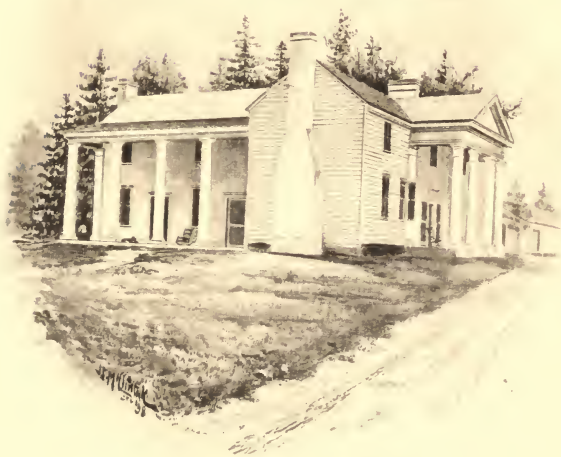
The Home of John C. Calhoun